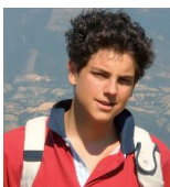
Blessed Carlo Acutis